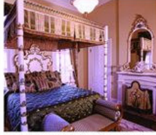
Custom silk bedspreads, designer window treatments, oriental carpets and incredible antiques are in every room at The Gates House Bed & Breakfast.